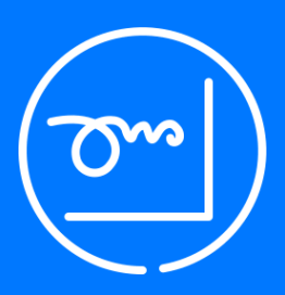
2% of GDP saved with digital signatures