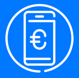
99% of banking done online