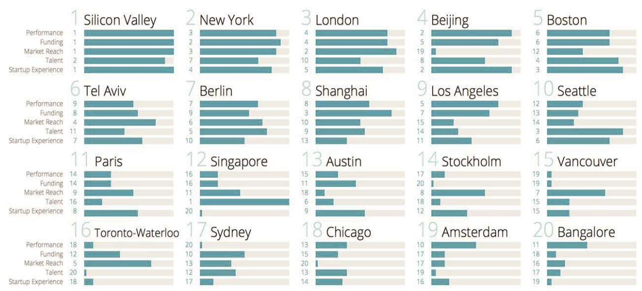
Table 2. 2017 Global Startup Ecosystem Ranking