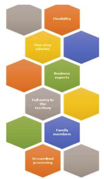
Figure 1. Key considerations of the Spanish startup scheme